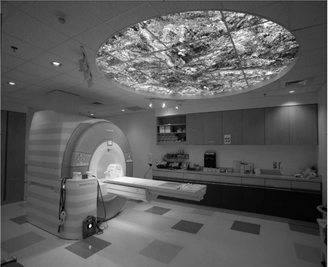
Figure 5. Sacred Passages—Equanimity. Magnetic Resonance Imaging Suite, Children’s Hospital of Philadelphia, King of Prussia Specialty Care Center, Philadelphia, PA.

© Vara Kamin’s Impressions of Light®.