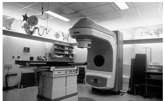
Figure 1. Kite Series. Joint Center for Radiation Therapy at Children's Hospital Boston, Boston, MA. © Joan Drescher

Drescher created a series of kites with symbols of healing for the Joint Center for Radiation Therapy at Children's Hospital Boston (see Figure 1). Children seem to be drawn to certain kites. For example, a 5-year-old girl looking at a painted kite resembling a fish said, "My special fish kite is always up there waiting for me" (Drescher, 1994, p. 10). The kite, a Japanese carp, is a symbol of courage.