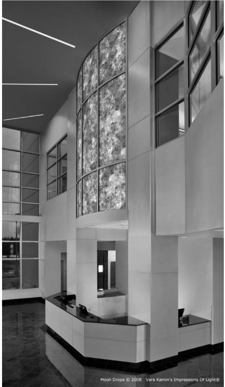
Figure 6. Moon Drops. Lobby Atrium, Lake Erie College of Osteopathic Medicine, Medical Fitness and Wellness Center, Erie, PA. © Vara Kamin's Impressions of Light®. © Scott Pease/Pease Photography.

Gilmore and Pine (1997) propose that if an experience is designed to be in tune with what an individual needs at an exact