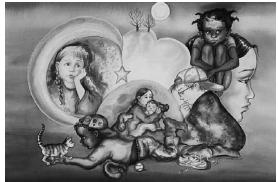
Figure 3. Not Feeling Well. Painted in blue, cold colors of fear and uncertainty, this mural depicts the feelings experienced upon receiving a diagnosis. Sometimes a mother's touch is what is needed most; sometimes only a pet can bring comfort and understanding. Floating Hospital for Children, Boston, MA.